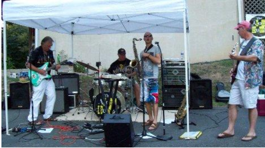
Atom Bumz Surf Band